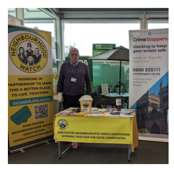
Darlington NW Association