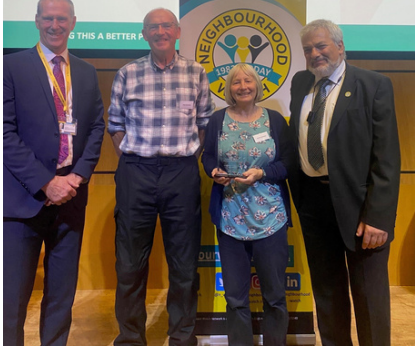
Fairfield Village Watch