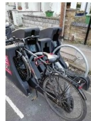
Number of people who reported their stolen bike to others (e.g. police 101, police online)