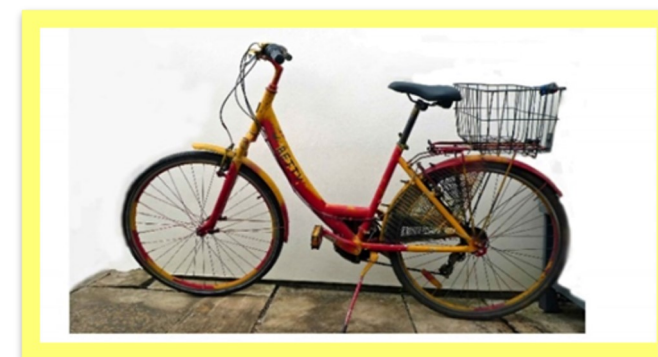
"Betty the Bike"

Part of an initiative supported by the University of Oxford's Science Together project